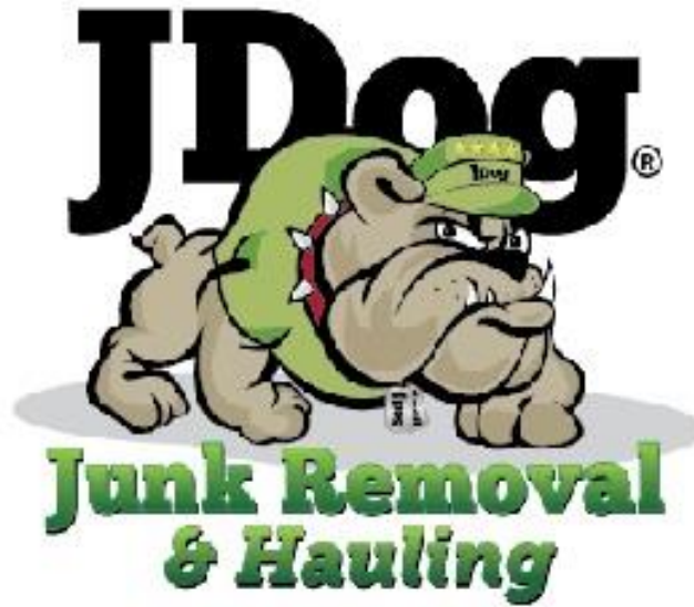
EXHIBIT B: FRANCHISE AGREEMENT