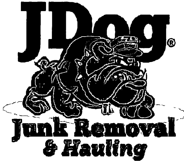
EXHIBIT B FRANCHISE AGREEMENT