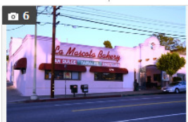
La Mascota Bakery Business and Real Estate for Sale

Restaurants for Sale | Food Stores for Sale | All Businesses for Sale in Los Angeles County