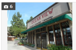
Ocean View Restaurant